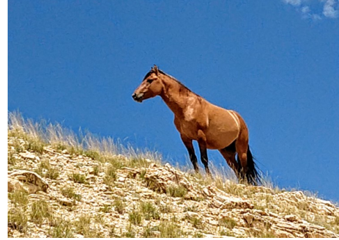
Horse on Ridge