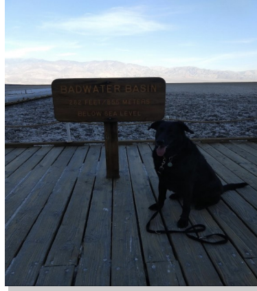
Bad Water Basin